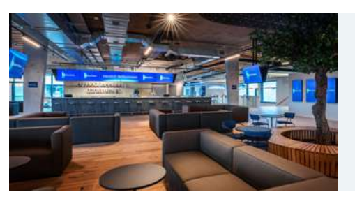
blue Cinema Chur 8 auditoriums IMAX® / 4DX / First Lounge / First Suite Sports bar / Gamezone / Virtual Game Arena Rooftop bar and open-air cinema