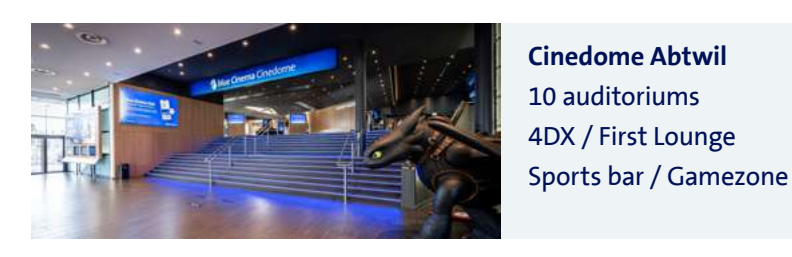
Cinedome Abtwil Scala St. Gallen 10 auditoriums 6 auditoriums 4DX / First Lounge